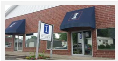
Johnson County Office at Vienna

Office Hours Mon—Fri 8am—4:30pm Closed Noon—1pm