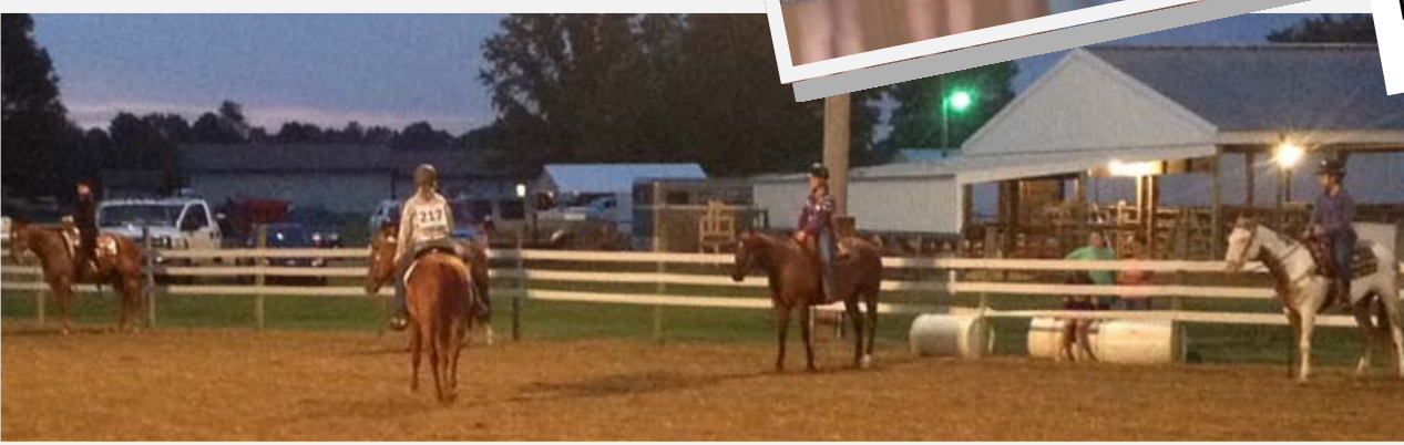
July 15 th AJMPU Horse Show At Massac County Fairgrounds