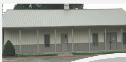
Alexander/Pulaski County office

Please visit us on the web at: http://web.extension.illinois.edu/ajmpu . Or find us on Facebook at: https://www.facebook.com/AJMPU.Unit . Check our YouTube Channel: https://www.youtube.com/channel/I0XtwgD4y3PQgLn2A