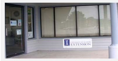
Union County office at Anna