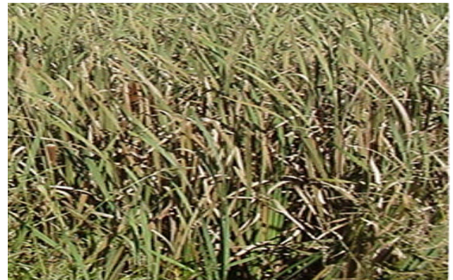
Figure 4: A dense stand of cattails growing at a ponds edge.

Cattail (Figure 4) is another common aquatic plant that occurs in shallow water environments. These perennial plants have extensive root systems, which require a systemic herbicide that will translocate throughout the entire plant, including the root, to provide control. Repeated applications may also be necessary. For optimal control, applications should be made in the summer prior to seed head formation.