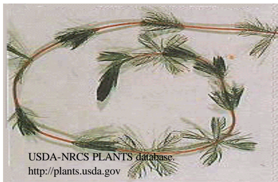
Figure 5: Eurasian watermilfoil. Note the presence of four leaves at each node with at least 10 leaflet pairs.

Eurasian watermilfoil (Figure 5) is a highly invasive aquatic plant that has been accidentally introduced into the waters of Illinois. Milfoils have feather-like leaves at their nodes with varying numbers of leaflet pairs per leaf. Eurasian milfoil has four leaves per node and usually ten or more leaflet pairs per leaf. Other native milfoils can be distinguished from Eurasian watermilfoil due to the fact that native species will have fewer than 10 leaflet pairs. Only a select few herbicides will control Eurasian watermilfoil. Similar to other perennial aquatic plants, complete control may require multiple herbicide applications.