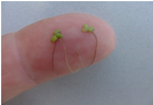
Figure 2: Individual duckweed plantlets with 3 leaflets.

Duckweed (Figure 2) is another common aquatic plant that floats on the water surface. Each plantlet can have from one to 5 or 6 leaflets, with a short root attached.