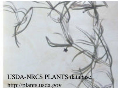
Figure 7: Leafy pondweed

Chemical control applications for non-perennial aquatic plants are best made in late spring (prior to extensive weed growth) when oxygen levels in the water are higher. Dead and decaying plant vegetation (as a result of plant control) will lead to a decrease in oxygen levels, which can initiate fish kills. Therefore, don't delay herbicide applications to late summer, when plant growth is extensive. If application must be made during summer, treat only a portion of the pond at any one time to avoid potential fish kills attributed to decomposition of dead plant material which can lead to reduced oxygen levels.