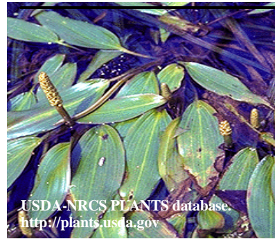
Figure 6: Illinois pondweed

Numerous species of pondweeds (that vary in appearance and utility) can be found throughout the waters of Illinois. The most common pondweeds are Illinois, American, and leafy pondweed. Illinois and American pondweeds are very similar in appearance as they possess both linear submerged leaves and floating elliptic shaped leaves. Floating leaves of both species are typically 1 to 4 inches in length with those of Illinois pondweed (Figure 6) being slightly larger and more oval in shape in comparison to the narrower and more elliptic shaped leaves of American pondweed. Leafy pondweed (Figure 7) is one of the most common of all the pondweeds and is distinguished from other aquatic weeds by the multiple submerged leaves that resemble short blades of grass attached to the main stem.