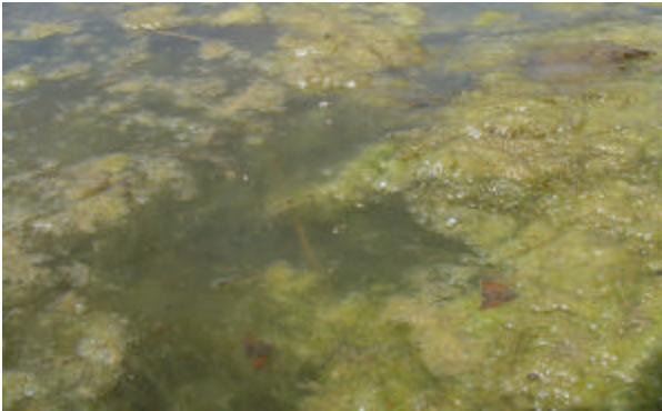
Figure 1: A body of water infested with spirogyra, a filamentous, mat-forming algae.

Algae is probably the most common and diverse of all aquatic weeds. Filamentous algae, often called moss, is free floating and demonstrates mat-like growth (Figure 1). Another type is microscopic algae, which forms a scum and, at high populations, can contribute to a yellow or green tint to the water.