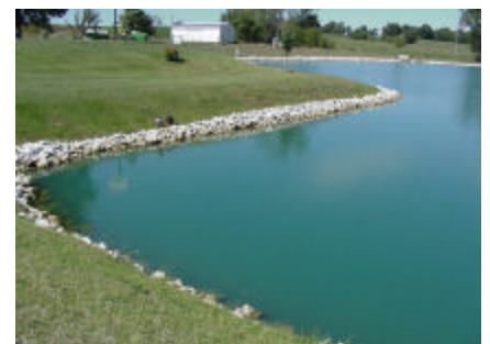
Figure 8: A pond that has been treated with an approved dye to help reduce aquatic plant growth.

Water dyes (Figure 8) can be used to reduce light transmission to underwater plants (plants rooted in water depths below 2-3 feet) helping to slow or eliminate their growth. Because the concentration of the dye must be maintained for long periods, the use of dyes may not be effective in ponds with substantial out flow.