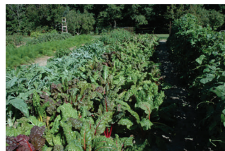
Summer Vegetables

within the farm. Although it will be necessary to purchase some equipment to work the farm, the bigger machinery will be leased as needed.