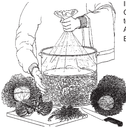
Illustration from USDA Complete Guide to Home Canning, Agriculture Information Bulletin No. 539. 9-94.

to three times each week (or even every day) and remove scum if it forms. Some people like to examine the kraut as it ferments and choose method 2 to follow the kraut's progress. After checking the kraut, re-cover container with clean plastic or cloth.