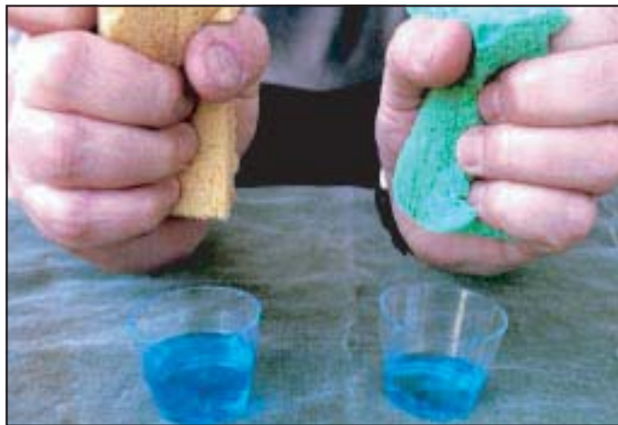
Figure 2: Available water capacity is greater with small pore size.

Soil quality with respect to available water is better for the soil from Maine (ME), because of both the internal properties and the lower evapotranspiration deficit.